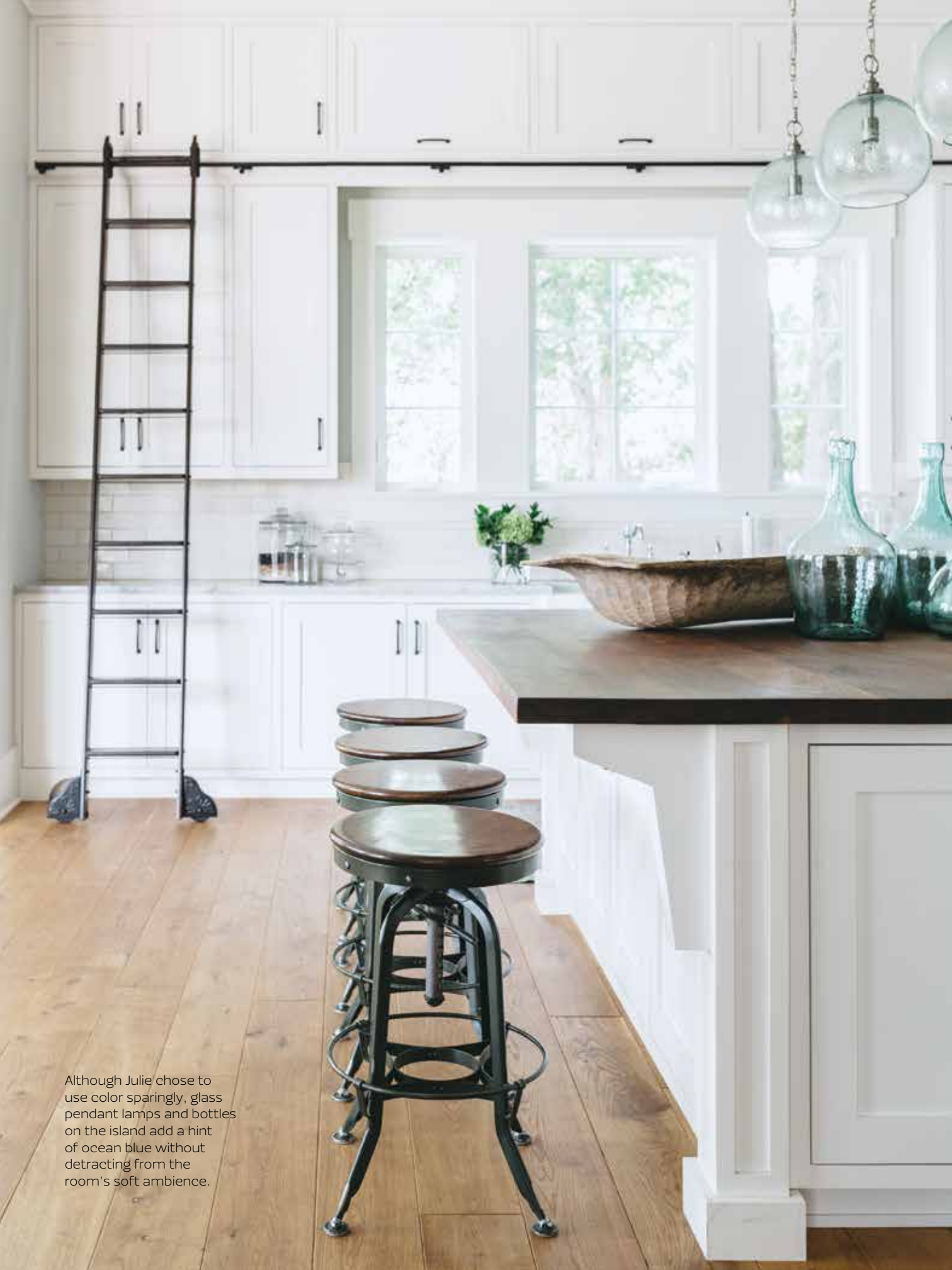
Although Julie chose to use color sparingly, glass pendant lamps and bottles on the island add a hint of ocean blue without detracting from the room's soft ambience.