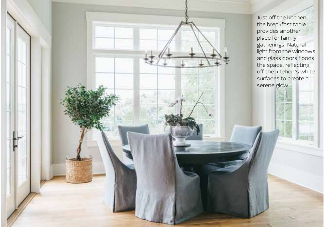
Just off the kitchen, the breakfast table provides another place for family gatherings. Natural light from the windows and glass doors floods the space, reflecting off the kitchen's white surfaces to create a serene glow.

TEXT BY BETHANY ADAMS